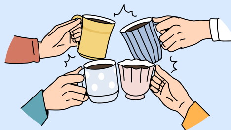
Coffee (a must for the adults!)